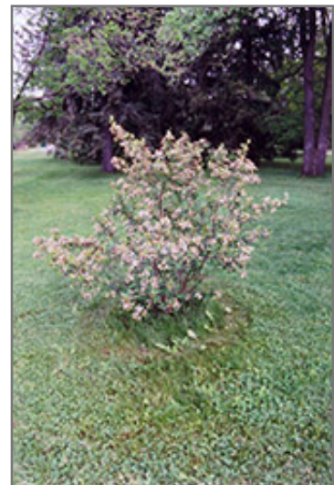
Black Chokeberry in bloom

Snavely's - Where good ideas keep on growing!