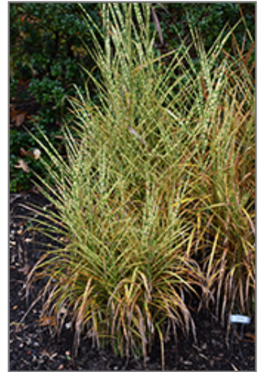
Gold Breeze Maiden Grass

Snavely's - Where good ideas keep on growing!