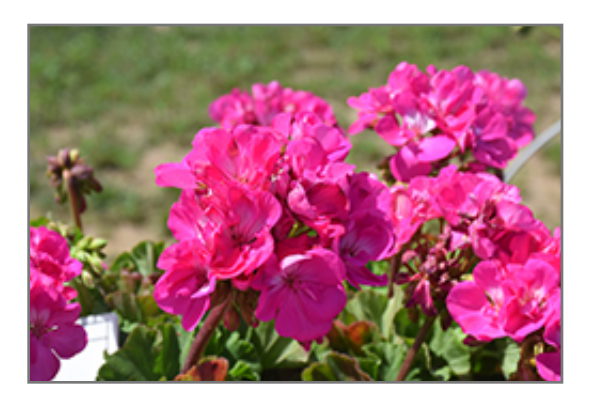
Americana Orchid Geranium flowers