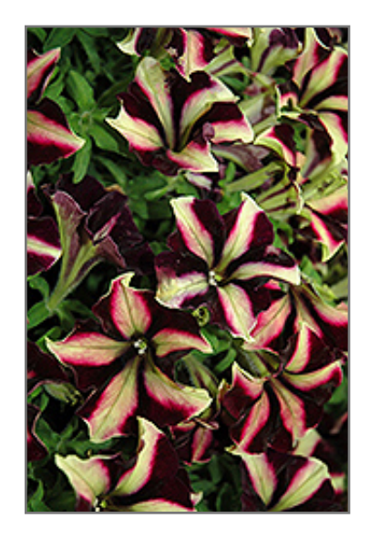
Crazytunia Pulse Petunia flowers