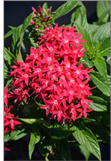
Graffiti Lipstick Star Flower flowers

Graffiti Lipstick Star Flower is recommended for the following landscape applications;