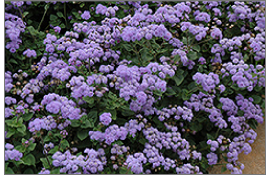
High Tide Blue Flossflower in bloom

High Tide Blue Flossflower will grow to be about 18 inches tall at maturity, with a spread of 16 inches. When grown in masses or used as a bedding plant, individual plants should be spaced approximately 12 inches apart. Its foliage tends to remain dense right to the ground, not requiring facer plants in front. This fast-growing annual will normally live for one full growing season, needing replacement the following year.