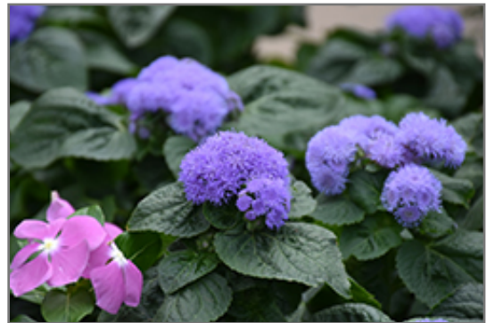
High Tide Blue Flossflower flowers

Snavely's - Where good ideas keep on growing!