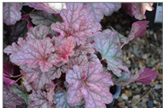
Kira Purple Rain Forest Coral Bells foliage