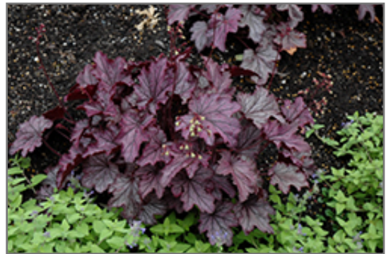
Spellbound Coral Bells

Snavely's - Where good ideas keep on growing!