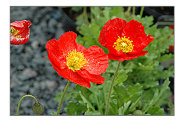
Spring Fever Red Poppy flowers