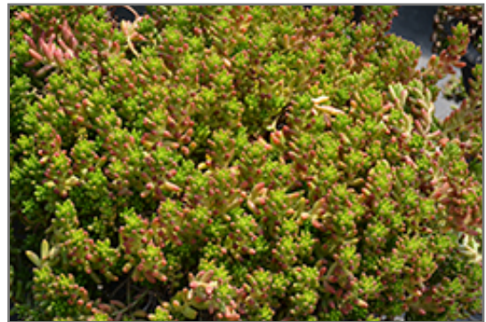
Jelly Bean Plant

Snaveley's - Where good ideas keep on growing!