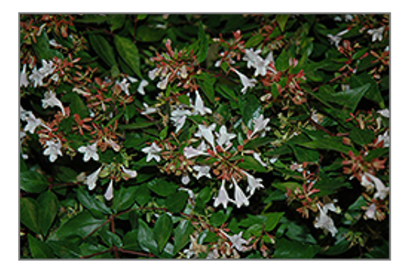
Bronze Anniversary Abelia flowers

2106 Lincoln Way E, Chambersburg, PA 17202 | (717) 352-2224 | snavelys.net | f@ snavelysgardencorner