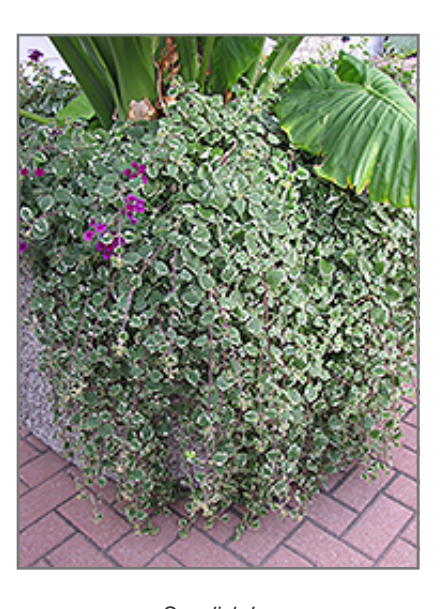
Swedish Ivy