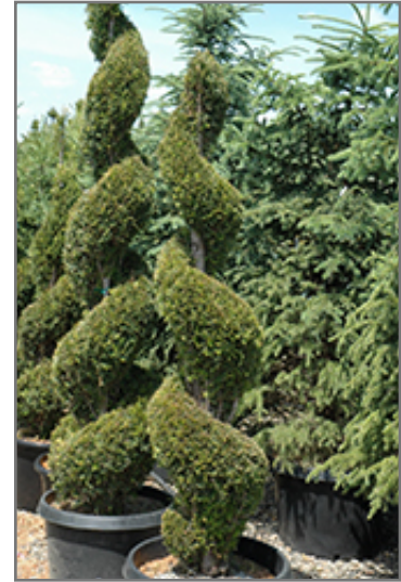
Emerald Green Arborvitae (spiral)

Snavely's - Where good ideas keep on growing!