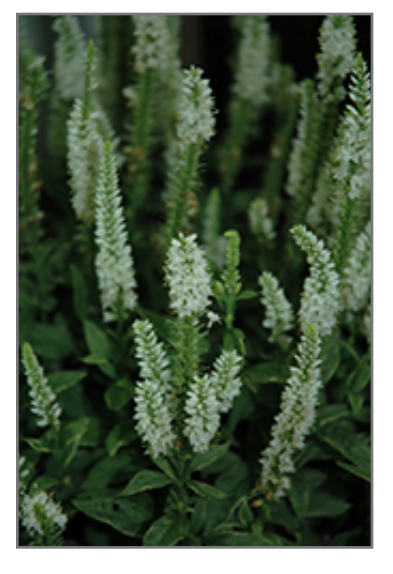
Charlotte Speedwell flowers