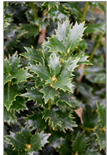
Acadiana Holly foliage

Snavely's - Where good ideas keep on growing!