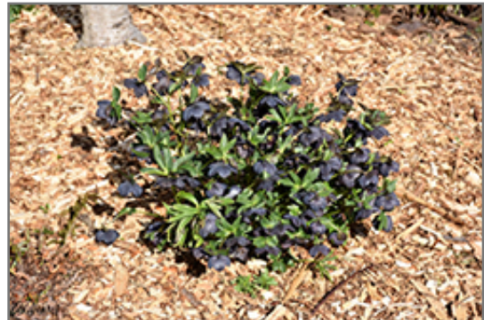
Winter Jewels Black Diamond Hellebore in bloom

Snaveley's - Where good ideas keep on growing!