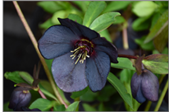
Winter Jewels Black Diamond Hellebore flowers

Winter Jewels Black Diamond Hellebore is recommended for the following landscape applications;