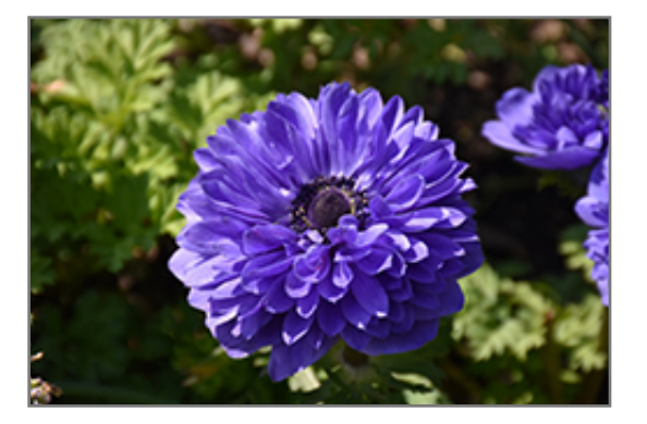
Blue Pandora Double Windflower flowers