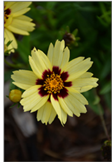
UpTick Cream and Red Tickseed flowers

UpTick Cream and Red Tickseed is recommended for the following landscape applications;