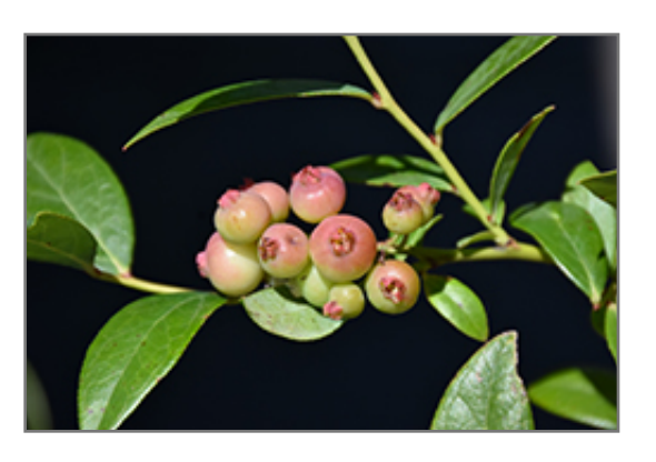
Pink Lemonade Blueberry fruit