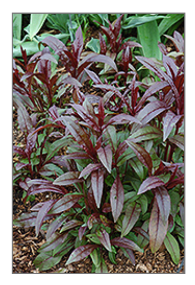
Husker Red Beard Tongue foliage