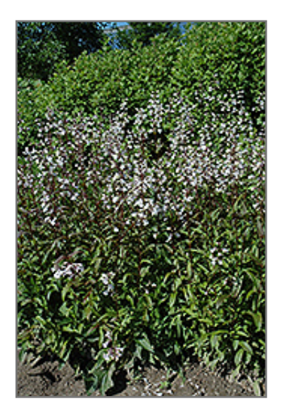
Husker Red Beard Tongue in bloom

This plant does best in full sun to partial shade. It prefers dry to average moisture levels with very well-drained soil, and will often die in standing water. It is considered to be drought-tolerant, and thus makes an ideal choice for a low-water garden or xeriscape application. It is not particular as to soil type or pH. It is somewhat tolerant of urban pollution. This is a selection of a native North American species. It can be propagated by cuttings; however, as a cultivated variety, be aware that it may be subject to certain restrictions or prohibitions on propagation.