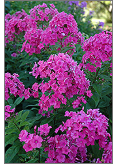
Eva Cullum Garden Phlox flowers