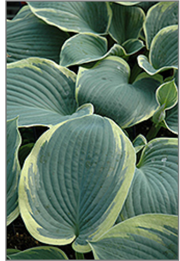
American Halo Hosta foliage

American Halo Hosta is recommended for the following landscape applications;