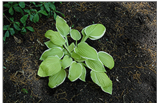
St. Elmo's Fire Hosta

Snavely's - Where good ideas keep on growing!