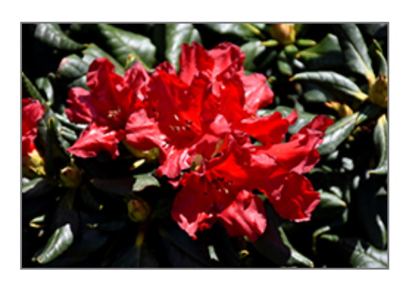
Baden Baden Rhododendron flowers