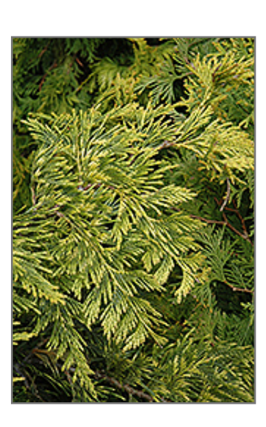
Zebrina Extra Gold Arborvitae foliage