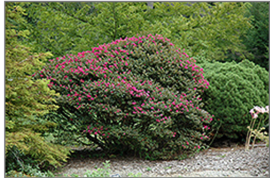
Pocomoke Crapemyrtle in bloom

Snavely's - Where good ideas keep on growing!