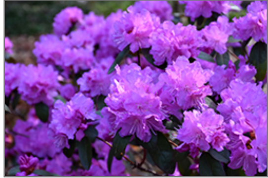
P.J.M. Elite Rhododendron flowers

P.J.M. Elite Rhododendron is recommended for the following landscape applications;