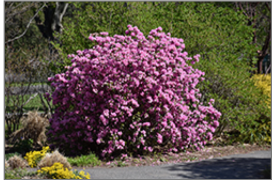
P.J.M. Elite Rhododendron in bloom

Snavely's - Where good ideas keep on growing!