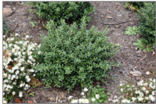
Soft Touch Japanese Holly

Snavely's - Where good ideas keep on growing!