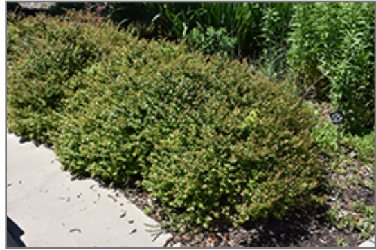
Rose Creek Abelia

Rose Creek Abelia makes a fine choice for the outdoor landscape, but it is also well-suited for use in outdoor pots and containers. Because of its height, it is often used as a 'thriller' in the 'spiller-thriller-filler' container combination; plant it near the center of the pot, surrounded by smaller plants and those that spill over the edges. It is even sizeable enough that it can be grown alone in a suitable container. Note that when grown in a container, it may not perform exactly as indicated on the tag - this is to be expected. Also note that when growing plants in outdoor containers and baskets, they may require more frequent waterings than they would in the yard or garden.