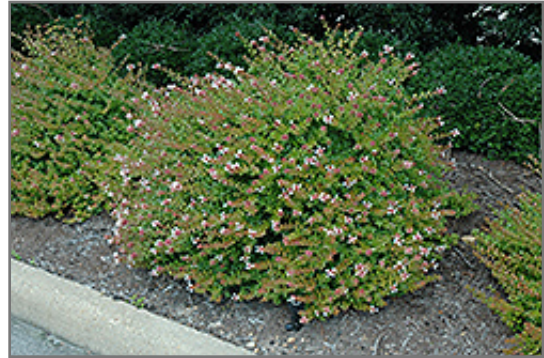
Rose Creek Abelia in bloom

Rose Creek Abelia is recommended for the following landscape applications;