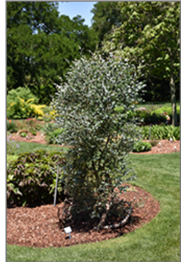
Silver Drop Cider Gum

This plant is not reliably hardy in our region, and certain restrictions may apply; contact the store for more information.