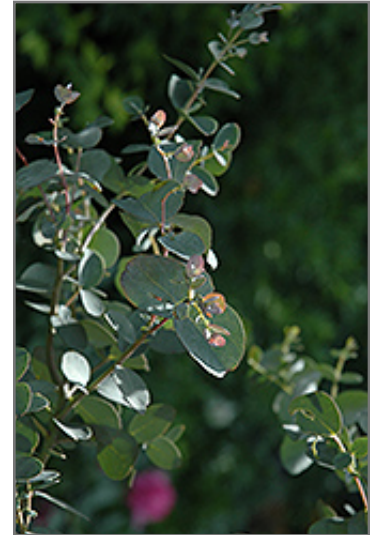
Silver Drop Cider Gum foliage