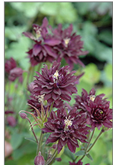
Clementine Dark Purple Columbine flowers

Snavely's - Where good ideas keep on growing!