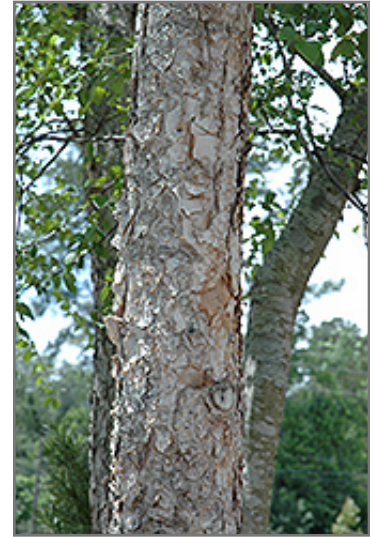
Dura Heat River Birch bark