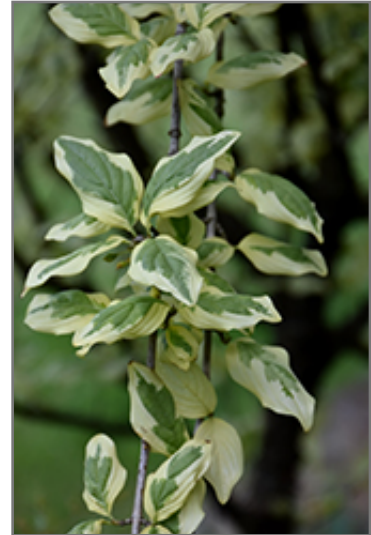
Variegated Cornelian Cherry Dogwood foliage