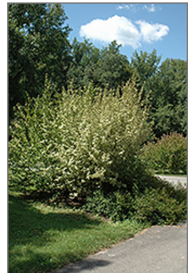
Variegated Cornelian Cherry Dogwood

Snavely's - Where good ideas keep on growing!