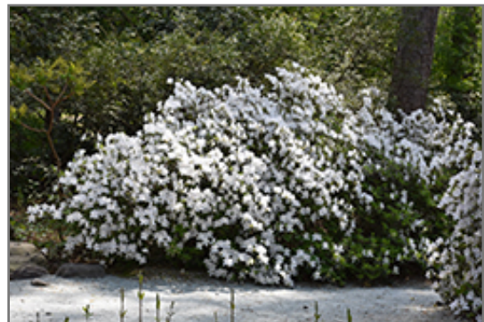
Delaware Valley White Azalea in bloom

Snavely's - Where good ideas keep on growing!