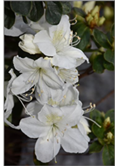
Delaware Valley White Azalea flowers