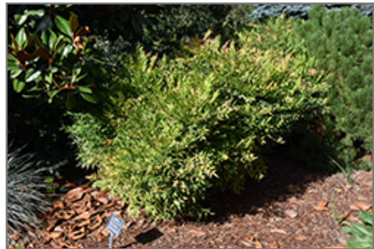
Gulf Stream Dwarf Nandina

Snavely's - Where good ideas keep on growing!